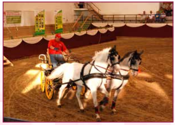
Professionals and visitors can take part in the pedigree exhibitions, professional forums, enjoy the horse shows, concerts and family programmes. They may also visit the game park and the petting zoo.

Information: Kaposvár University, www.kan.ke.hu