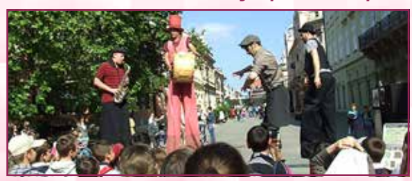
Information: Csiky Gergely Theatre, Tel.: 82/511-207, 511-208